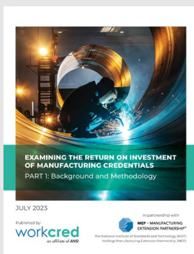
Background and Methodology

A set of recommendations stemming from our findings has been developed in order to operationalize the results of this research and are included in the next report, Examining the Return on Investment of Manufacturing Credentials: Recommendations . 14