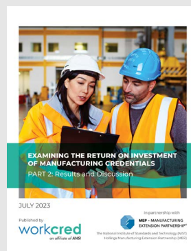
Results and Discussion