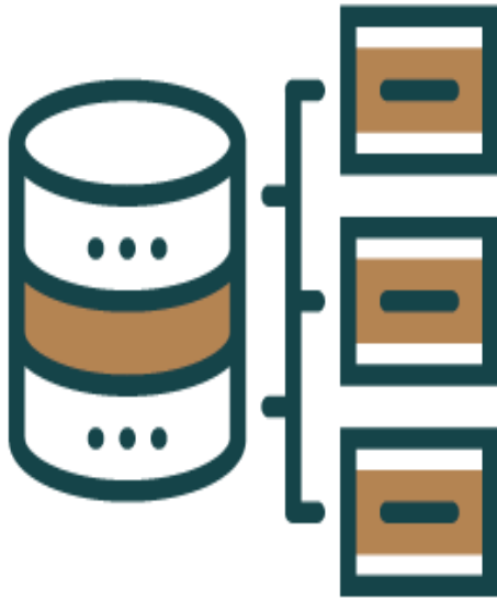
Credential Transparency Description Language (CTDL)