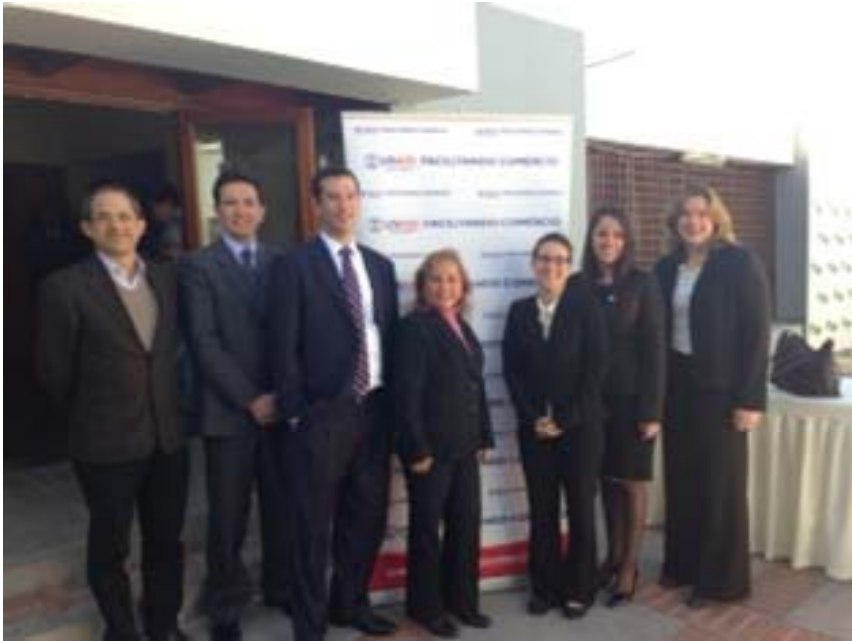
Speakers at the workshop in Arequipa, Peru