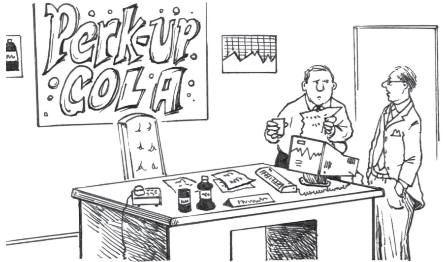
We don't seem to be doing well in the foreign beverage market. However, due to a mistranslation of our slogan we've become the leading international provider of embalming fluid.