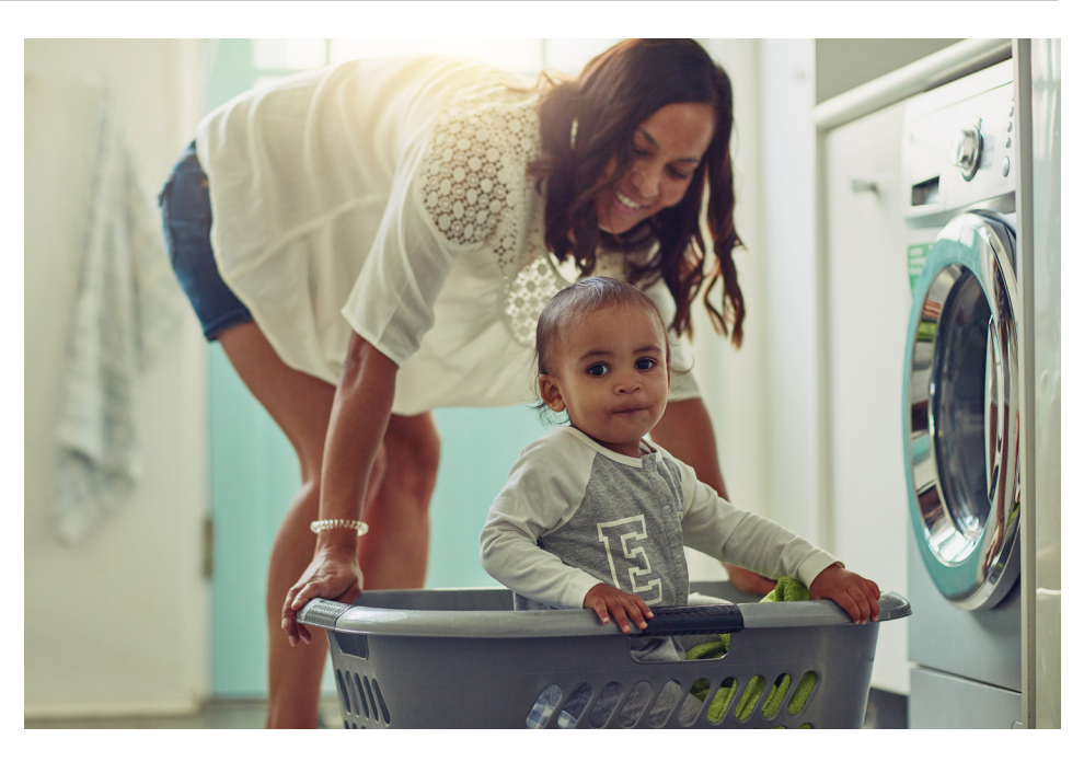
THE RESULTS OF AHAM'S WORK CAN BE SEEN IN MAJOR FEDERAL AND STATE LEGISLATION AND IMPROVED SAFETY AND ENERGY EFFICIENCY STANDARDS FOR APPLIANCES.

Advocating for U.S. requirements in international standards helps U.S. manufacturers gain access to worldwide markets for their products. AHAM engages extensively with other SDOs such as IEC, UL, CSA, and ASTM International; and serves on advisory