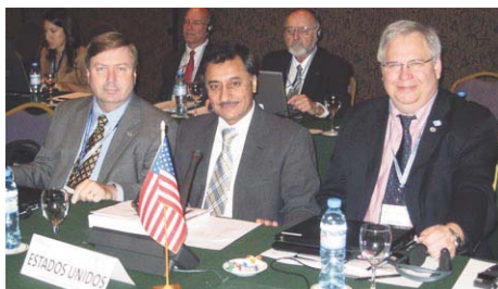
Heads of the United States ANSI Delegation to COPANT Assembly 2008