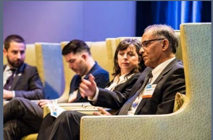
USTDA contractor Oorja Protonics raised more than $1 million through the 2017 Industry Growth Forum