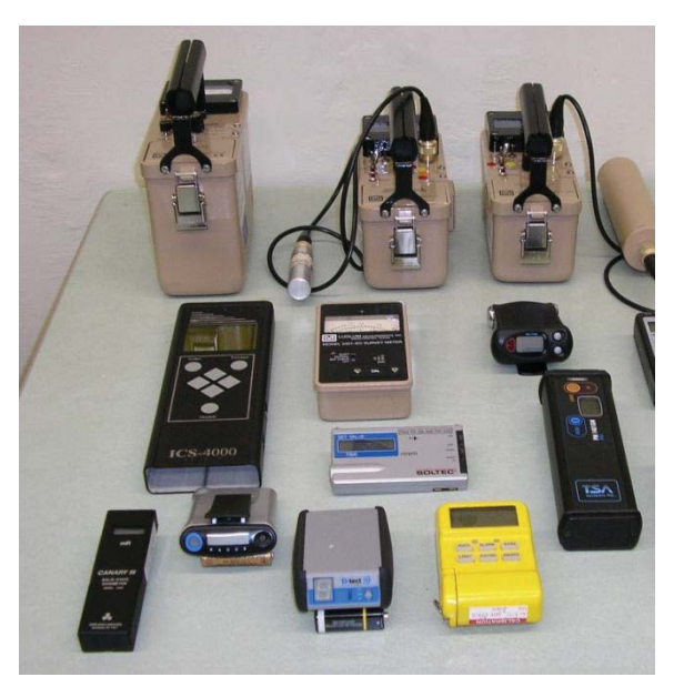
Figure 3R. Handheld radiation detectors.

together with NIST and NIST's National Voluntary Laboratory Accreditation Program (NVLAP) under which laboratories perform independent and consistent testing of the commercial-off-the-shelf radiation detectors.<sup>8</sup> Results of the GRaDER program testing will be made available to law enforcement and first responder agencies to inform their procurement and grant awards processes.