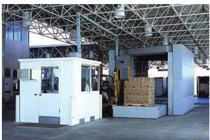
Figure 2R. Cargo screening equipment installed at an airport facility.