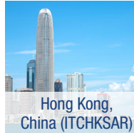
Hong Kong, China (ITCHK SAR)