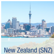
New Zealand (SNZ)