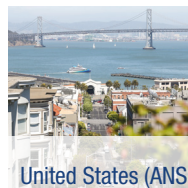
United States (ANSI)