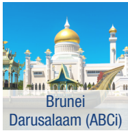
Brunei Darusalaam (ABCI)