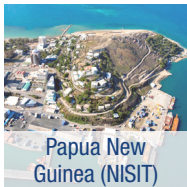
Papua New Guinea (NISIT)