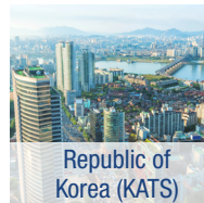
Republic of Korea (KATS)