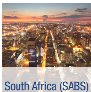
South Africa (SABS)