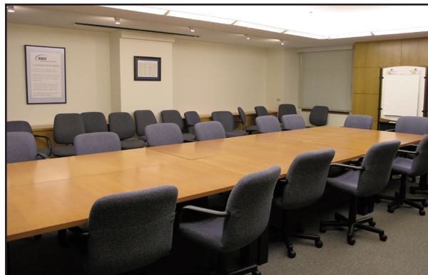
FEDERATION ROOM (A AND B COMBINED)