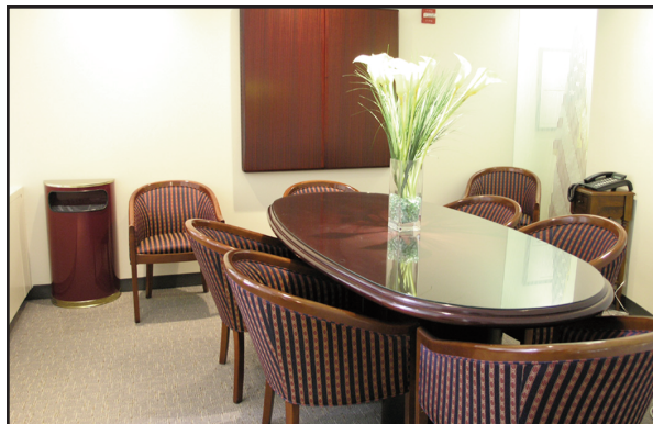
DAN SMITH ROOM

An intimate meeting space, the Dan Smith Room is ideal for a small business meeting. Measuring 13' x 14.5', this windowed room can comfortably accommodate six to eight people at its 7' x 3' glass-covered oval table. A wall-mounted white board and accessories are included. Additional IT and audio/visual services are also available.