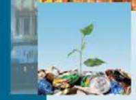
SUSTAINABLE URBAN DEVELOPMENT