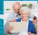
AMBIENT ASSISTED LIVING