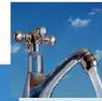
DRINKING WATER/WASTE WATER