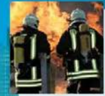
SAFETY AND PUBLIC SECURITY