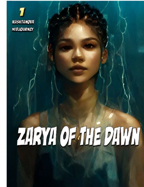
Zarya of the Dawn