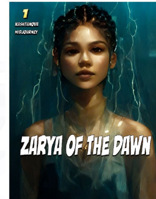
Zarya of the Dawn