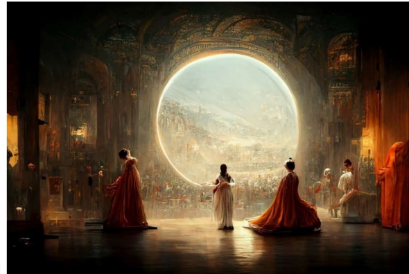
Théâtre D'opéra Spatial