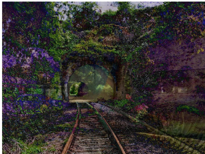
A Recent Entrance to Paradise