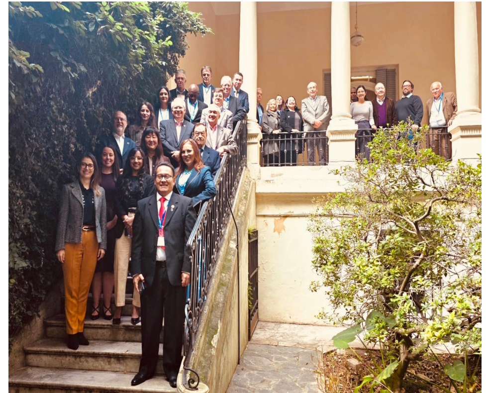
USNC delegation at FINCA 2025, Buenos Aires, Argentina