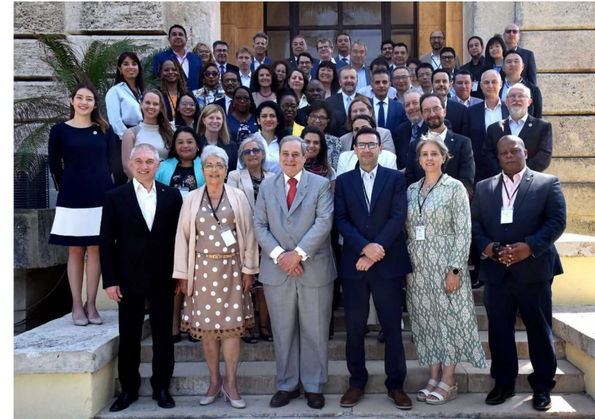
ANSI delegation at COPANT 2025, Havana, Cuba

Panel 2: Cross-Border and International Harmonization: The importance of aligning standards for regional resilience, approaches and climate action