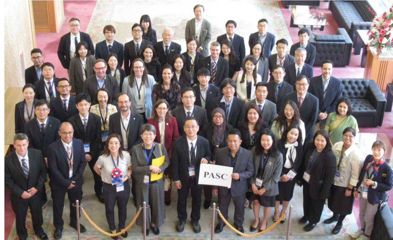
ANSI delegation at PASC 2025, Tokyo, Japan